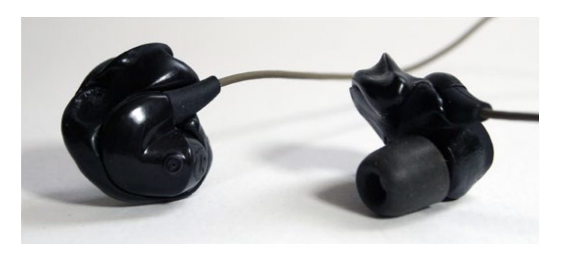
Note: If desired molding not achieved, remove and place in boiling water again to remold.