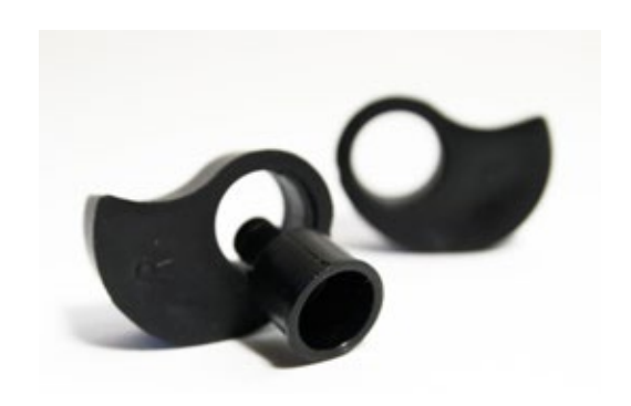
1. Remove plastic insert from hole.