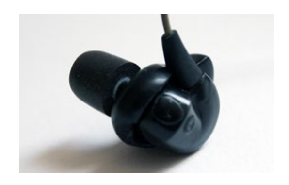
3. One at a time, while warm, place on ear bud, then attach foam ear tip.